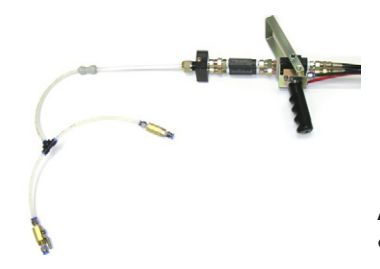
Applicator with Static Mixer & Split-Set (optional)